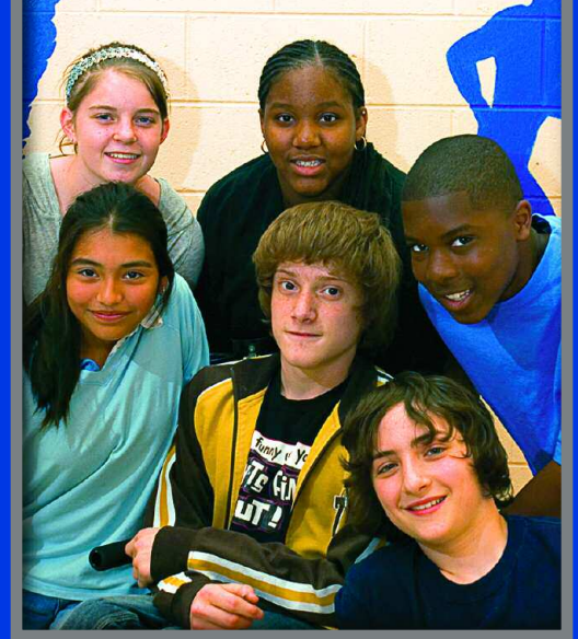
7th & 8th graders in the Cafeteria at F. Niel Postlethwait Middle School

For a spanish version of this brochure, please go to www.udel.edu/compromiso