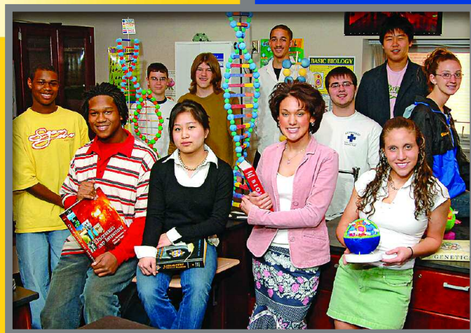
Biology & Physical Science Students at Caesar Rodney High School

It is as close to a "guarantee" as we can make it. While no university can guarantee admission until a student has submitted a complete application, we can lay out what you need to do in grades 9 through 12 if you want to give yourself the best chance of being admitted. Our intention is to help students, parents, teachers, and guidance counselors answer the question, "How can students best prepare themselves for admission into the University of Delaware?"