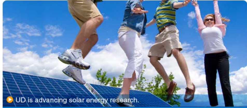
UD is advancing solar energy research.

Plants grow in virtually every habitat on Earth, producing oxygen and helping to sustain life. Learn more>>