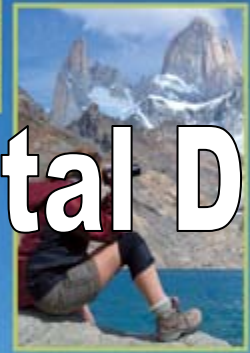
The world is our environmental classroom! Through UD's award-winning study abroad program, students can visit sites like Mt. Fitz Roy in Argentina.

UD's top-notch facilities such as our 146-foot research vessel Hugh R. Sharp provide the latest technology for exploring the sea.