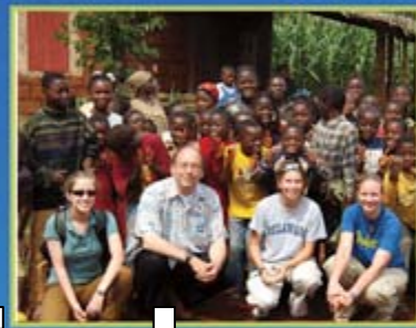
UD students involved in Engineers Without Borders are helping to bring clean drinking water to Bakang, a village in Cameroon.

Let the sun shine! A leader in solar energy research, UD is advancing the development of high-efficiency solar cells.