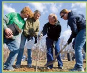
Student members of the Wildlife Conservation Club plant trees on the UD farm.